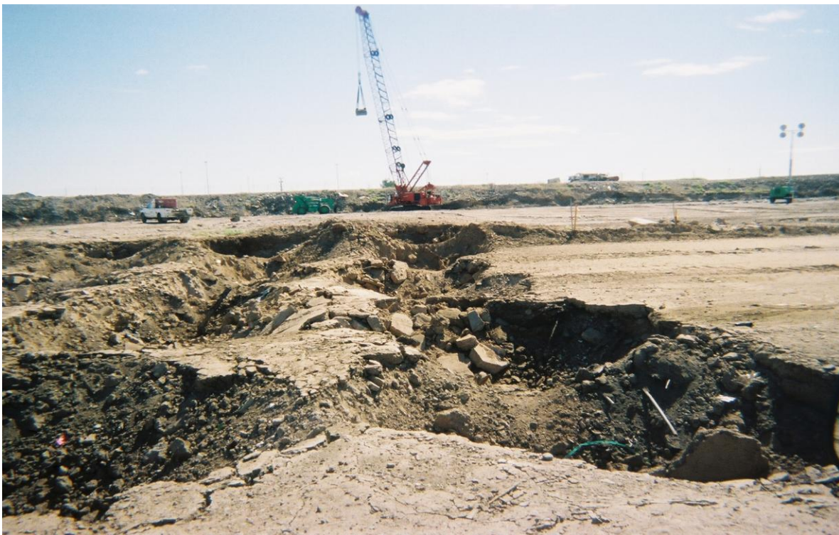
Ground Improvement with Deep Dynamic Compaction at 24 th Street and Riverview Drive, Phoenix, Arizona