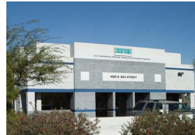
Hoque & Associates, Inc. facility at 4325 S. 34 th Street in Phoenix, Arizona

Hoque & Associates strives to build lasting client relationships through commitment, communication, innovation, and quality responsive service to establish and maintain our standing as a premier consultant in our fields of expertise.